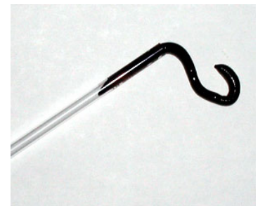
Figure 2. Earthworms permit in vivo imaging with easy shimming, no NIH regulations, and little motion (when the tube is cooled). When the worms are returned to the ground, they have great stories for their friends!